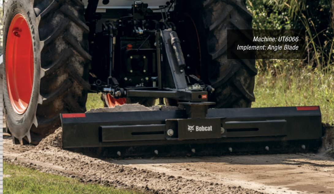
Machine: UT6066 Implement: Angle Blade