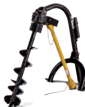
3 pt. auger