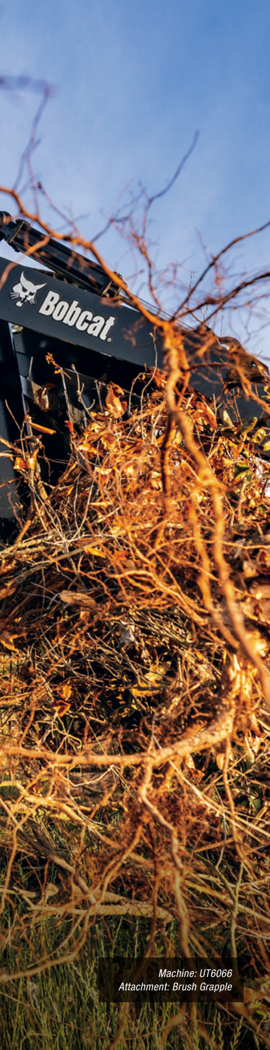
Machine: UT6066 Attachment: Brush Grapple

Bobcat tractors offer five different transmission types available on select models. Multiple models offer both a standard and optional transmission type.