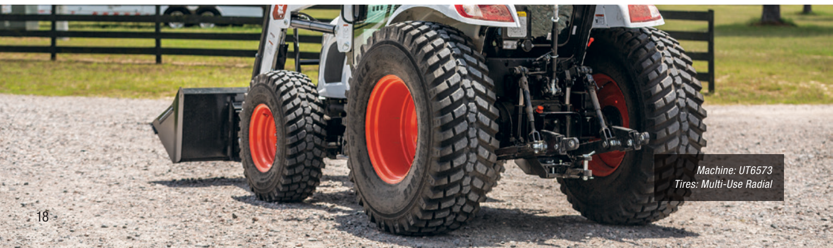
Machine: UT6573 Tires: Multi-Use Radial