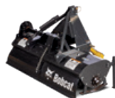
3 pt. tiller