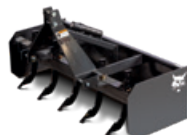
3 pt. box blade