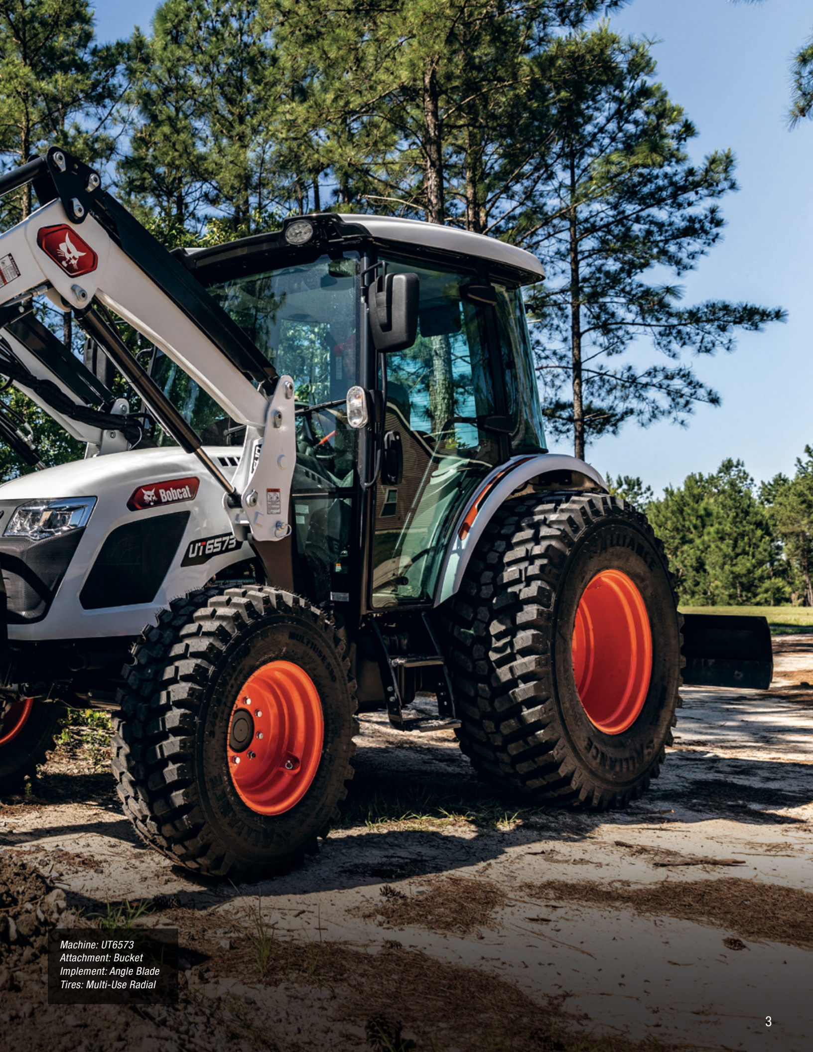
Machine: UT6573 Attachment: Bucket Implement: Angle Blade Tires: Multi-Use Radial