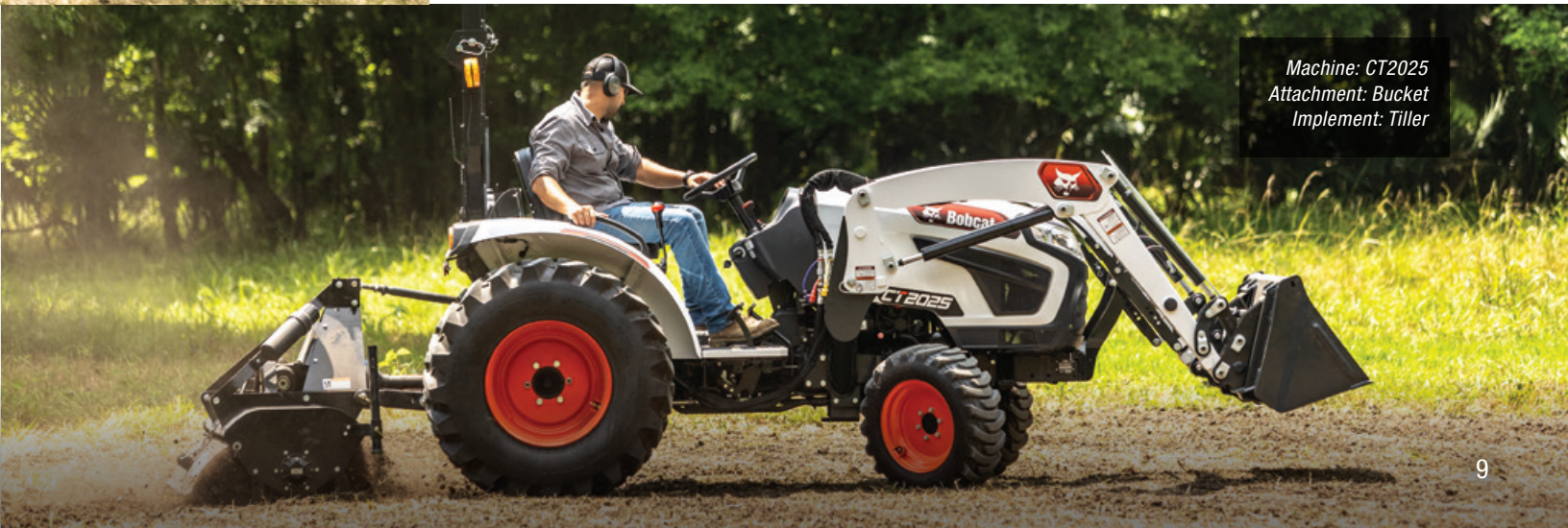
Machine: CT2025 Attachment: Bucket Implement: Tiller