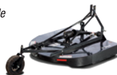
3 pt. rotary cutter