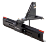
3 pt. angle blade