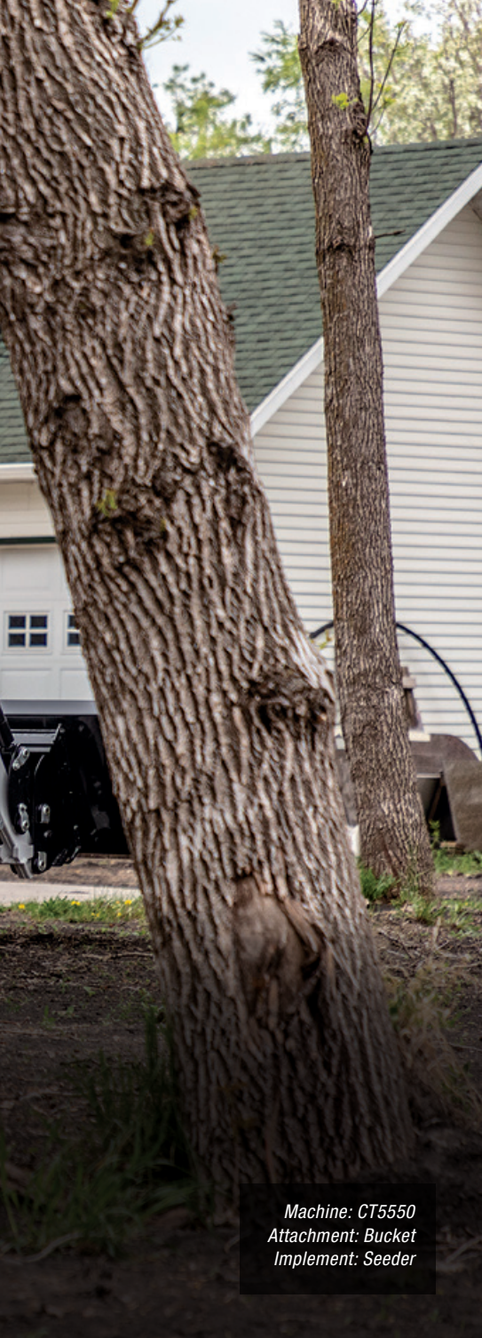
Machine: CT5550 Attachment: Bucket Implement: Seeder