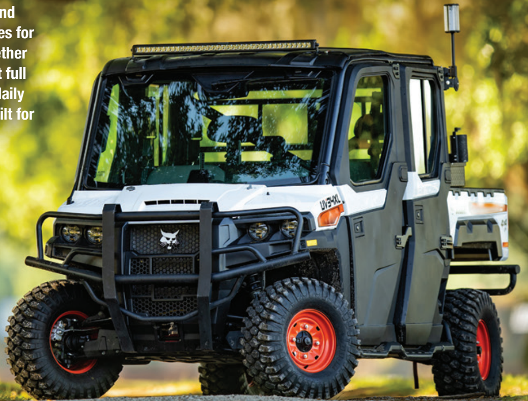
Machine: UV34XL Limited Package

Bobcat accessory packages equip you for every challenge and adventure with tailored upgrades for your Bobcat utility vehicle. Whether you're running your weekend at full throttle or gearing up for your daily grind, these accessories are built for real life and real work.