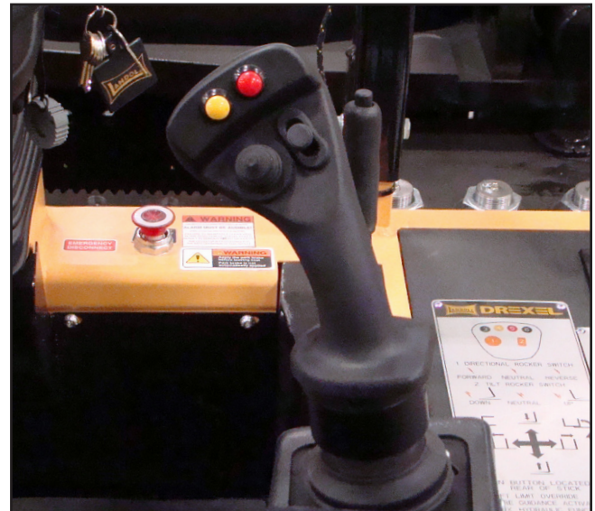
Single Joystick Controls for All Hydraulic Functions, Directional Control and Horn