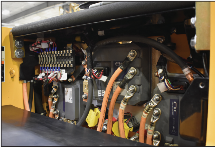
Removable Cover Provides Easy Access to All Control Components