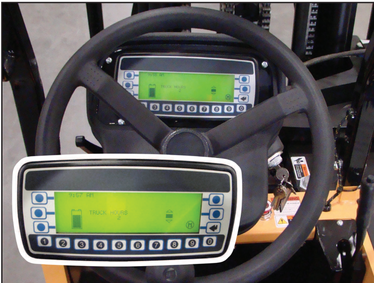
Dash Display with Full Diagnostics, Hour Meter and Battery Discharge Indicator