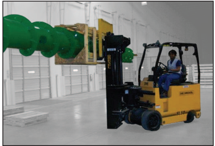
Long Load Handler