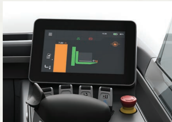
Interactive touchscreen display